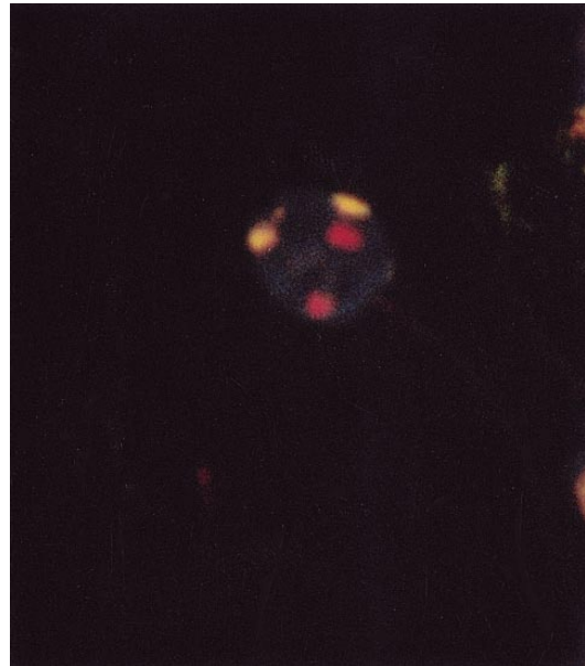
Fig. 2 Diploid XX decondensed interphase human spermatozoon showing two yellow signals (chromosome 1) and two red signals (chromosome X)

Plasmid probes pUC1.77, pXBR2 and pHY2.1, which were specific for chromosomes 1, X and Y, respectively, were used. 1 and X were \alpha -satellite probes specific for centromeres; the Y probe was specific for a repeat sequence on the long arm of the Y (Yq12).